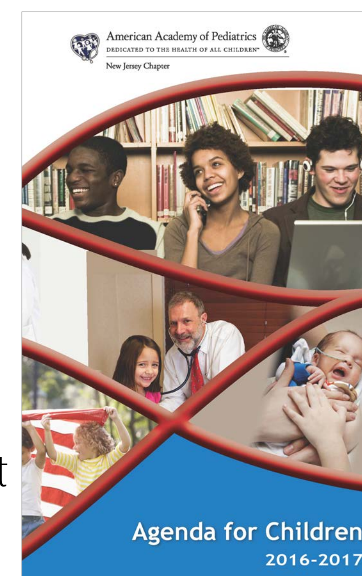
Actual size of child health booklet MTAAP hopes to emulate

Research was gathered from within MTAAP, other AAP state chapters, the national AAP organization, Montana Department of Public Health and Human Services, Montana KIDS COUNT, the state legislative website and the Centers for Disease Control and Prevention. Information from these sources was analyzed and interpreted for use in the booklet.